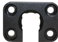
10-24 x 12 Socket Head Screws