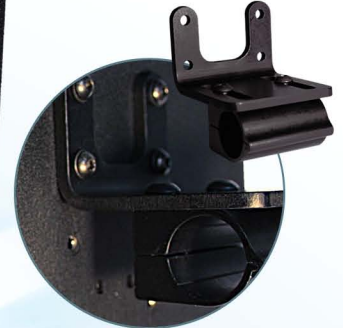
Double Slot Mount