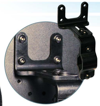
Single Slot Mount